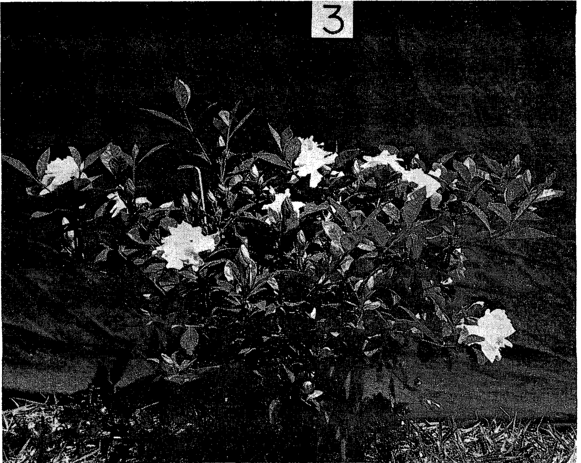
Figure 2.—An average more compact Gardenia plant having been treated with Cycocel.

Long day photoperiods were maintained until short day treatments were started as follows: L_1 — September 1, L_2 — September 15 and L_3 — September 29, 1965; at the initiation of short days (plants shaded from 5 p.m. to 8 a.m.